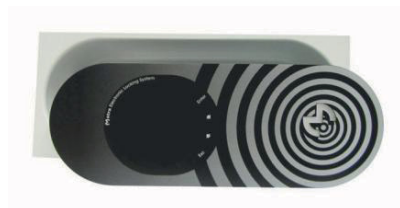
Reader Terminal: 4 digit LED display with build-in RFID media reader.

Metra Reader Terminal is used as a user interface device.