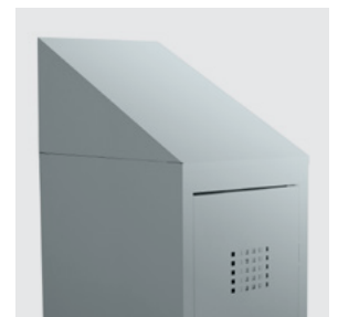
SLOPING TOPS OF 30° OR 40°.