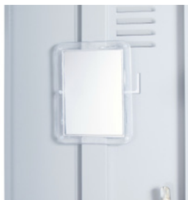
MAGNETIC INTERNAL DOOR MIRROR.