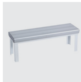
LOCKER SEATS (ALUMINIUM OR TIMBER SEAT).