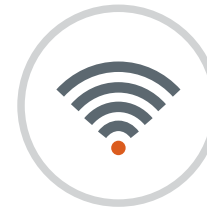
Online view of locker's state.