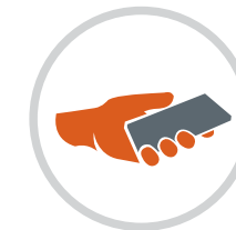
No need for multiple Access Control RFID smart cards.