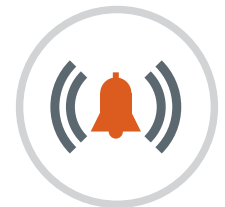
Alarm in case of break-in.