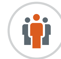
Member and casual locker access.