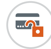
RFID media or smartphone app access.