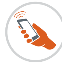
Simply open locker door with your smartphone.