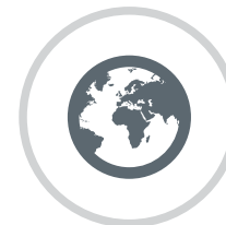
World-class technology solution.