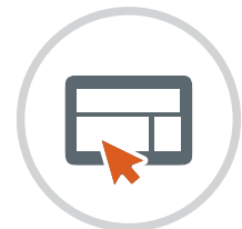
Fully controlled & managed with integrated software.

Contact METRA today for more details of extending HID™ technology.